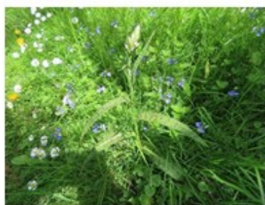
Common Spotted Orchid in bud