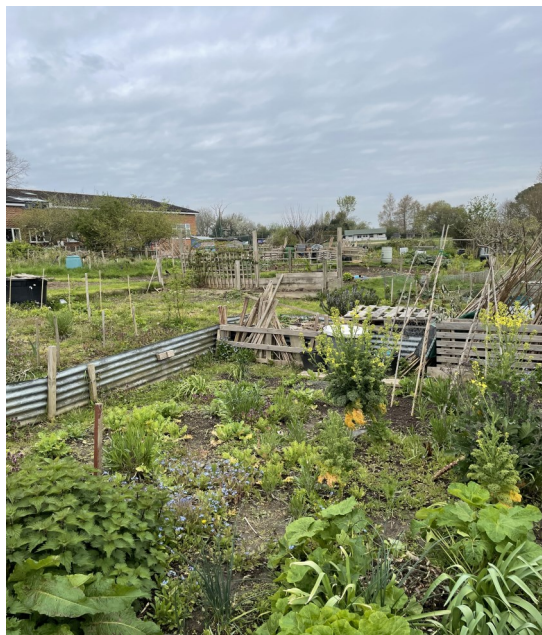
Picture of the allotments at Speldhurst