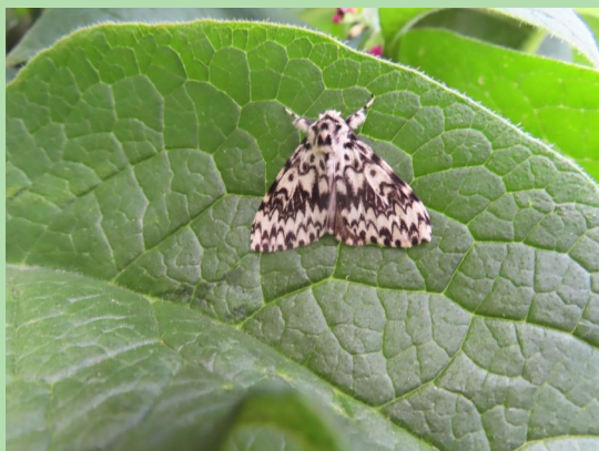
A black arches/nun moth