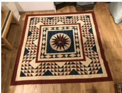
One of Dar's quilts