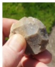
Late Neolithic Orthoquartzite Scraper