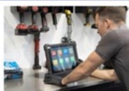
Car and Light Van Service and Repair