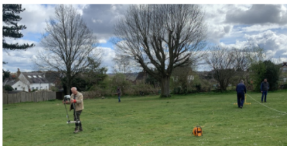
Geophys Survey on The Rec

In 2023 a small archaeological investigation was undertaken at a property in Barden Road at Speldhurst. With expectations of finding little more than a few rusty nails or the odd bit of Victorian willow pattern pottery a small test pit was opened up in the back garden. However one of the very first objects to be pulled from the hole was a fragment of Romano-British 'Colour Coated Ware' – a rarity in these parts. This was followed by even older material in the form of a Mesolithic stone tool, taking the story of human activity back many thousands of years! With such an encouraging start several more test pits were opened up across the garden area and the dig was joined by members of West Kent Community Diggers (WKCD).