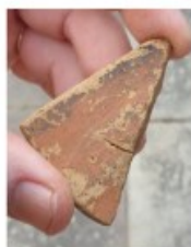
Romano-British Colour Coated Ware