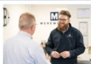
Great Customer Service Established 45 years