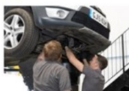
MOT Repairs, Hybrid Servicing

Unit 2B, North Farm Road Tun Wells TN2 3DR